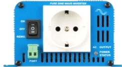
Phoenix Inverter 12/180 with Schuko socket