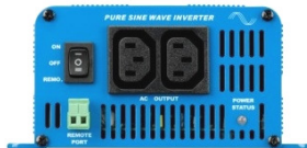
Phoenix Inverter 12/350 with IEC-320 sockets