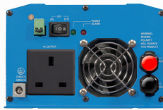
Phoenix Inverter 12/800 with BS 1363 socket