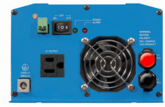
Phoenix Inverter 12/800 with Nema 5-15R socket