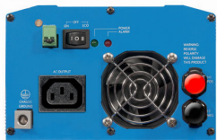
Phoenix Inverter 12/800 with IEC-320 socket