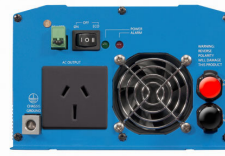
Phoenix Inverter 12/800 with AN/NZS 3112 socket