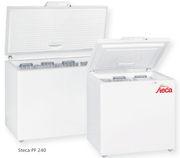
Steca PF 240

This product stands out for its user-friendliness, thanks to a large digital display with setting options, the highest standards of quality and reliability and a long service life. The refrigerator or freezer is easy to clean as it has a sealing plug on the bottom for draining water.